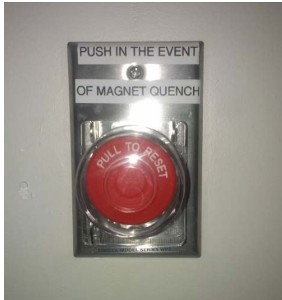
Figure 4. Quench button in the control room.