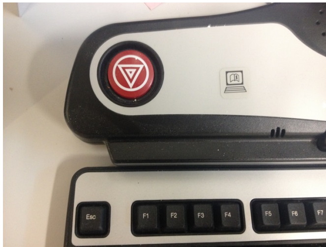
Figure 5. Emergency Off Button in the control room.

The button should be used only to stop a scan during a patient emergency or during a serious equipment fault or hazard, such as fire or water in the vicinity of the MR equipment.