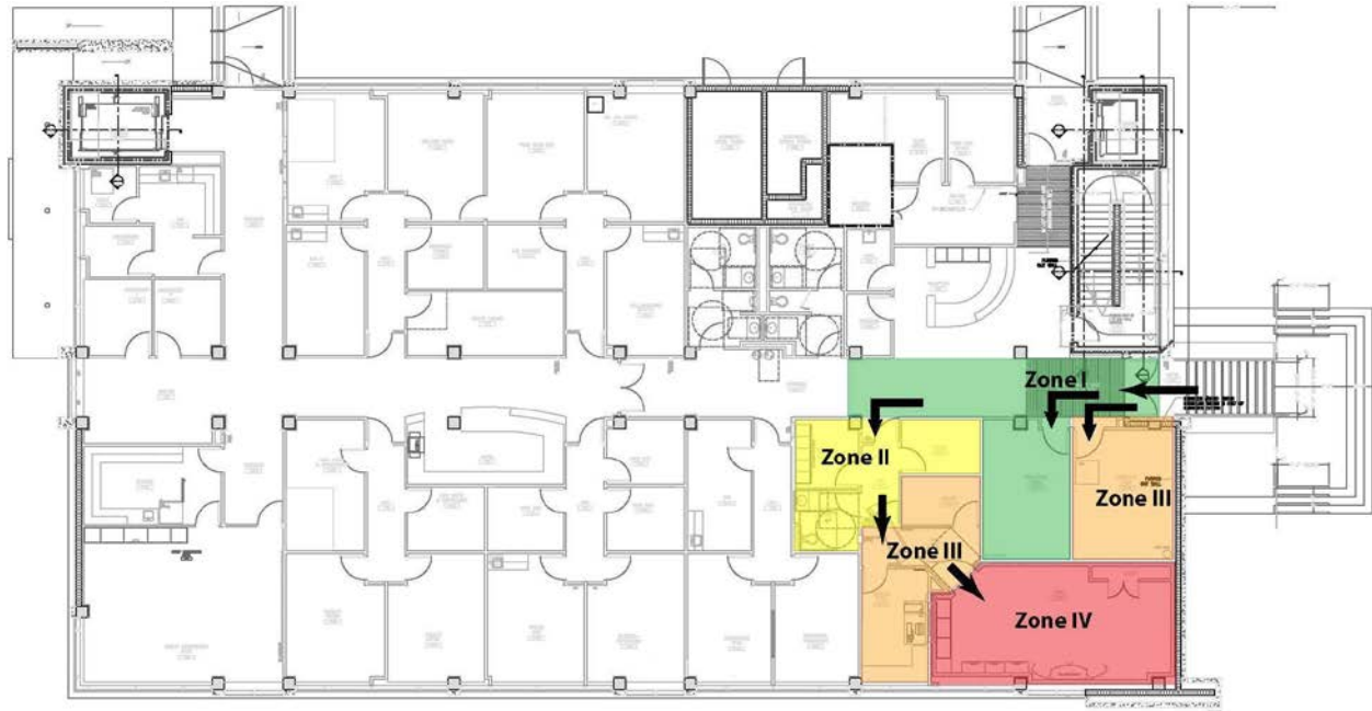
Figure 2. Diagram of the fMRI suite and zone designations.

Zone I is freely accessible by individuals working in the building. No special screening is required to be in Zone I.