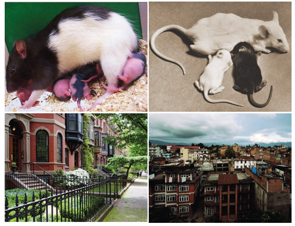
Different upbringings. Being raised by a nurturing ( top left ) or a lackadaisical ( top right ) mother can cause epigenetic differences that affect a rat pup's behavior later in life. Whether similar differences occur in people raised in wealthy ( bottom left ) or impoverished ( bottom right ) neighborhoods remains an open question.